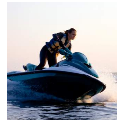
TENDER & JET SKIS